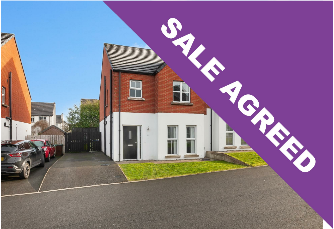
6 Henryville Drive, Ballyclare, BT39 9XW